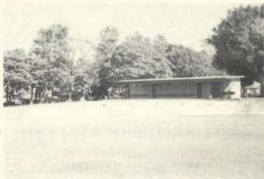
Club's Toilet and Changeroom Facilities at Harold Fraser Oval. Blakehurst

165 Forest Road, Hurstville Phone 570-6933