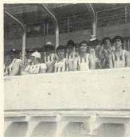
Athletes at Australia Day Relays, Canberra, January, 1981.