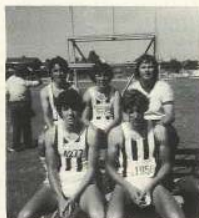
Dubbo Open Carnival — January, 1981