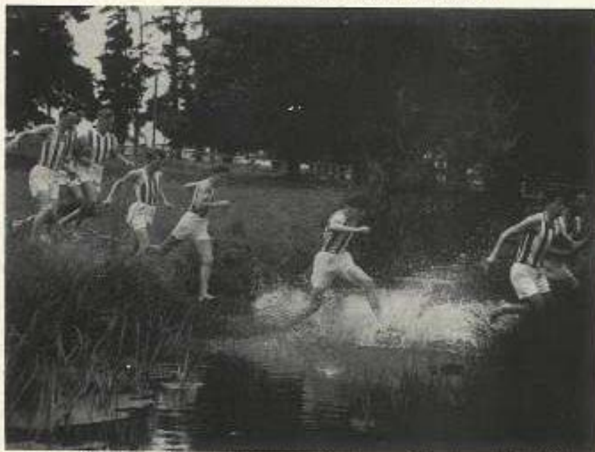
Senior St. George athletes at Ramsgate, Scarborough Park, probably 1949.

The new Club members were successful in open competition.