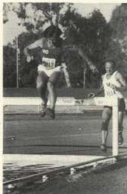
John Bowers (4114), World Veterans Champion for 3000m Steeplechase in New Zealand, 1981.