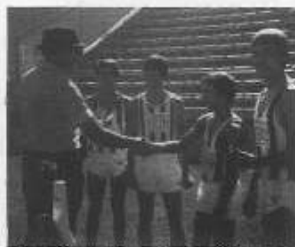
Australia Day Relays, Under 16 Years 4 x 200 metres. Outstanding male team of the carnival taking 12 seconds from the A.C.T. record.