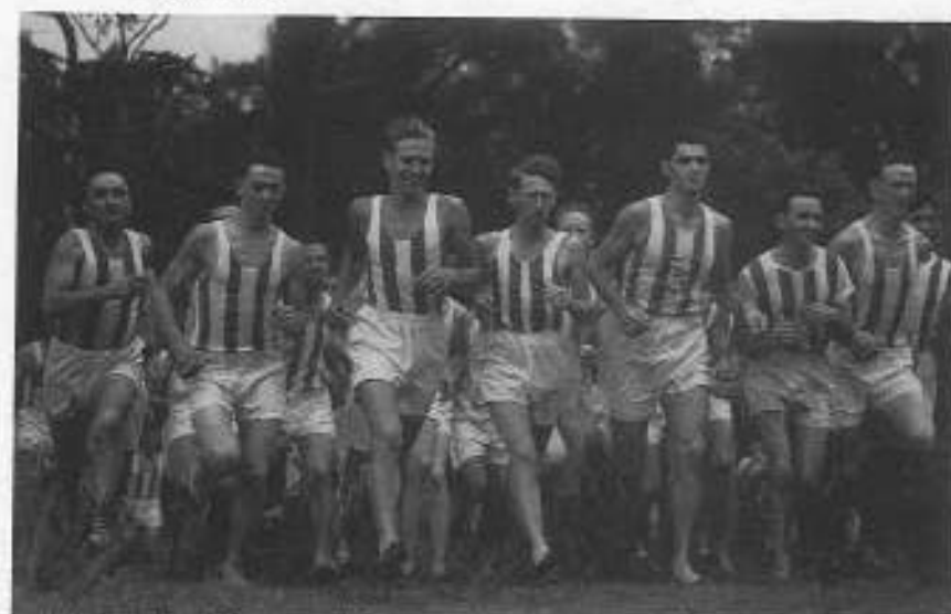
St. George Cross Country athletes running at Ramsgate, Scarborough Park, probably 1949.