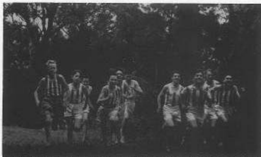
St. George Sub-Junior Athletes running at Ramsgate, Scarborough Park, probably 1949.