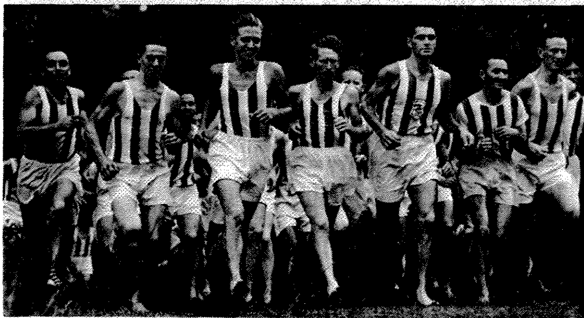
St. George cross country athletes running at Ramsgate Scarborough Park, probably 1949.