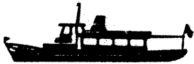
M.V. "SPIRIT OF SYDNEY" 80ft. LICENSED LUXURY CRUISER

WE WANT YOUR BUSINESS. GIVE US THE OPPORTUNITY TO QUOTE & YOU WON'T BE DISAPPOINTED