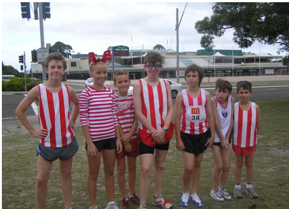
THE CHRISTMAS MILE RUNNERS - 2007