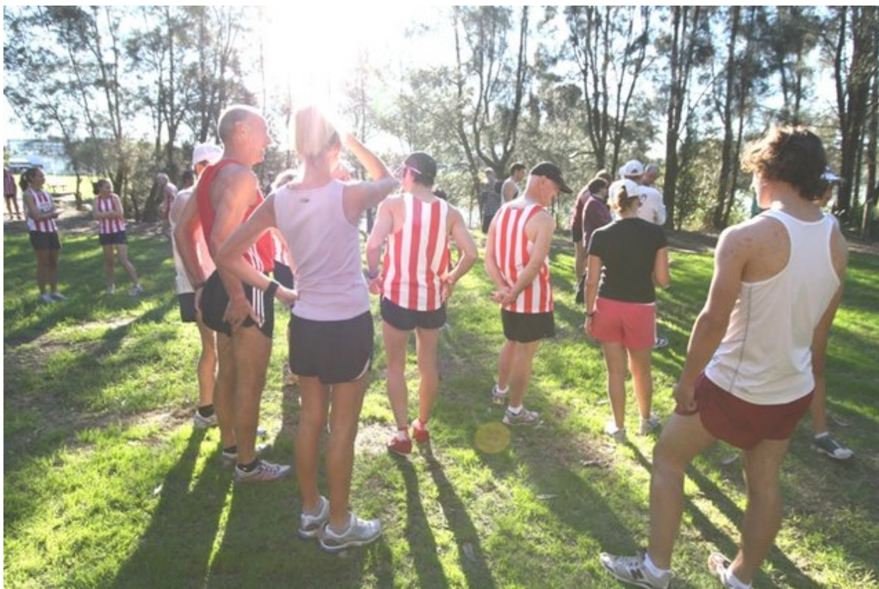
Starters basking in the warm Saturday afternoon sun as they get ready for the Seniors Event at Scarborough Park, Ramsgate.

St George District Athletics Club members would like to thank the support given to the club by