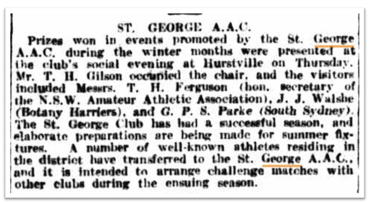
Sydney Morning Herald - 8 October 1921 - p15