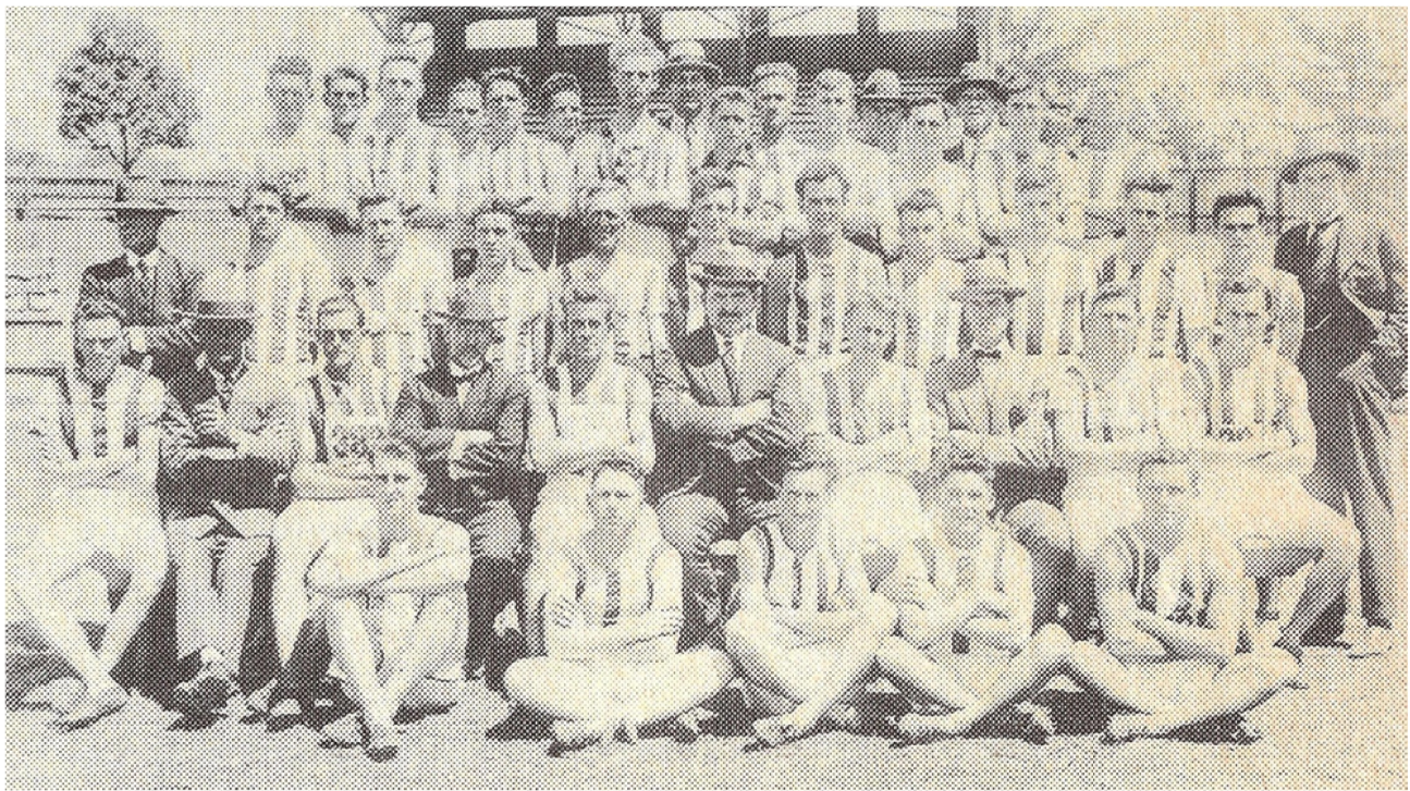
1925/6 St George Club photo at Hurstville Oval